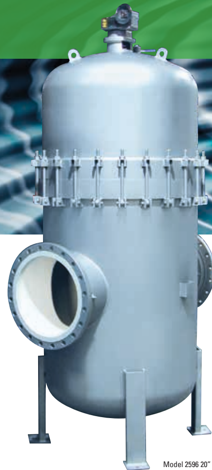
Model 2596 20"

Eaton's Model 2596 Fabricated Automatic Self-Cleaning Pipeline Strainers are available in 10", 12", 14", 16", 18", 20", 24", 30", 36", 48", and 60" sizes. Continuous flow, simplified maintenance, and worry-free operation characterize the Model 2596 across numerous industries.